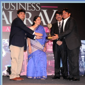
National Award Winner